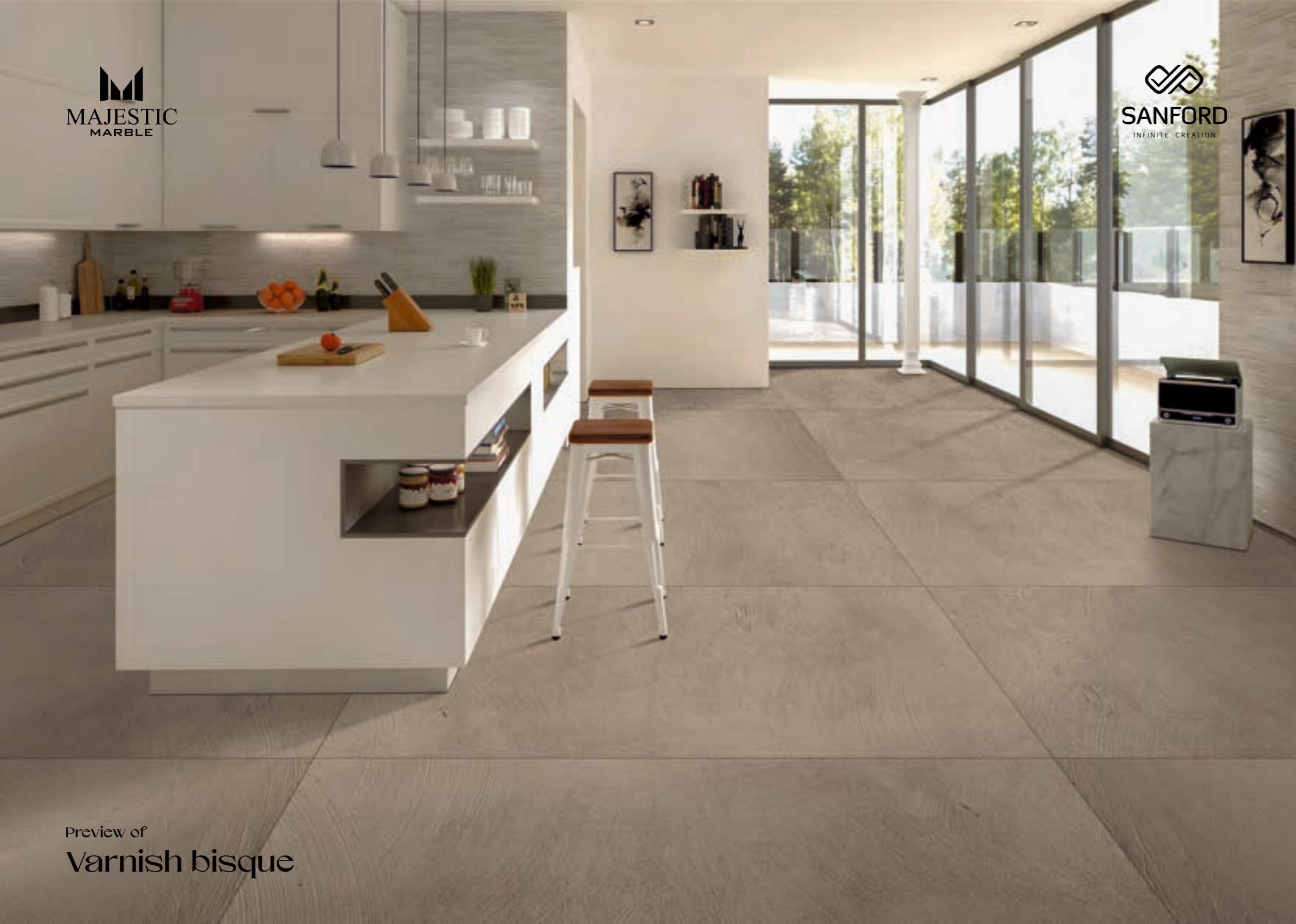
Preview of Varnish bisque